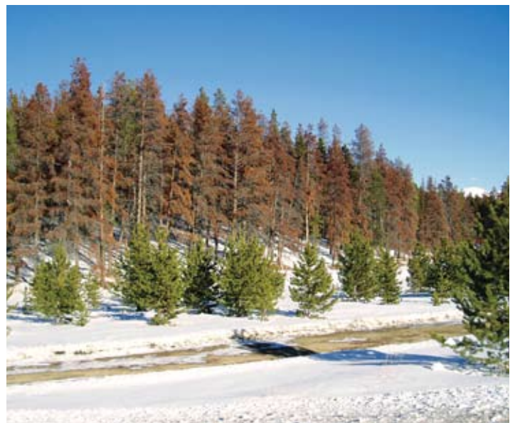
During the most recent MPB epidemic, some areas have experienced nearly 100-percent mortality of larger trees.

For example, Denver Water actively managed its forest stands in Grand County for many years prior to the current beetle epidemic. Stands were thinned in many areas and dwarf mistletoe-infected stands were clearcut and regenerated, as were some larger, older stands. This treatment strategy resulted in stands of trees that are too small and/or vigorous for the beetles to successfully attack. Larger trees in thinned stands responded to thinning in varying degrees, making them more resistant to beetle attacks. These were some of the very last stands in the area to succumb to the beetle. Stand life was marginally extended as a result of the thinning. If the epidemic had been less intense, it is likely that many of these trees might have survived. In addition, these managed stands existed for many years in the absence of wildfire hazards due to improved understory vegetation. Further benefits included wildlife habitat, aesthetics, and other values.