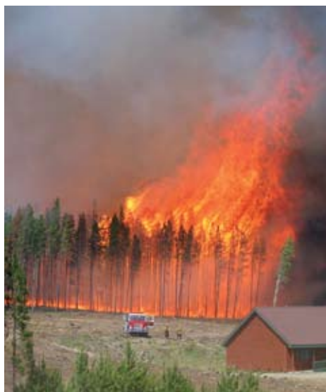
The 2007 Y Fire in Grand County occurred in MPB-impacted stands of lodgepole pine.

pine beetle epidemic on this scale. In pure lodgepole pine forests, crown fires are possible before and after an epidemic while needles are still on trees. Intense surface fires are possible after most dead trees have fallen to the ground. The probabilities of such fires are uncertain, and more research is needed to determine in what ways and how long the fuels and fire environment are altered by the beetles. Nevertheless, protecting communities and other values at risk is imperative.