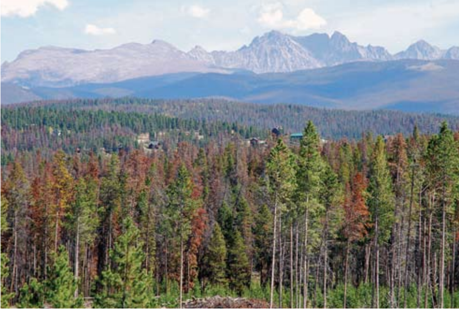
During the current epidemic, beetles have killed most trees over a number of years as shown by the mix of grey, red, and green trees.