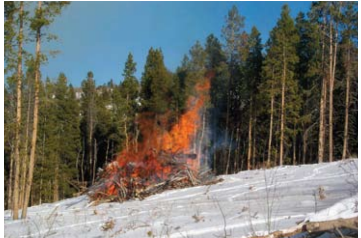
Careful burning of slash piles during periods of adequate snow cover or moisture is an effective method of disposal.