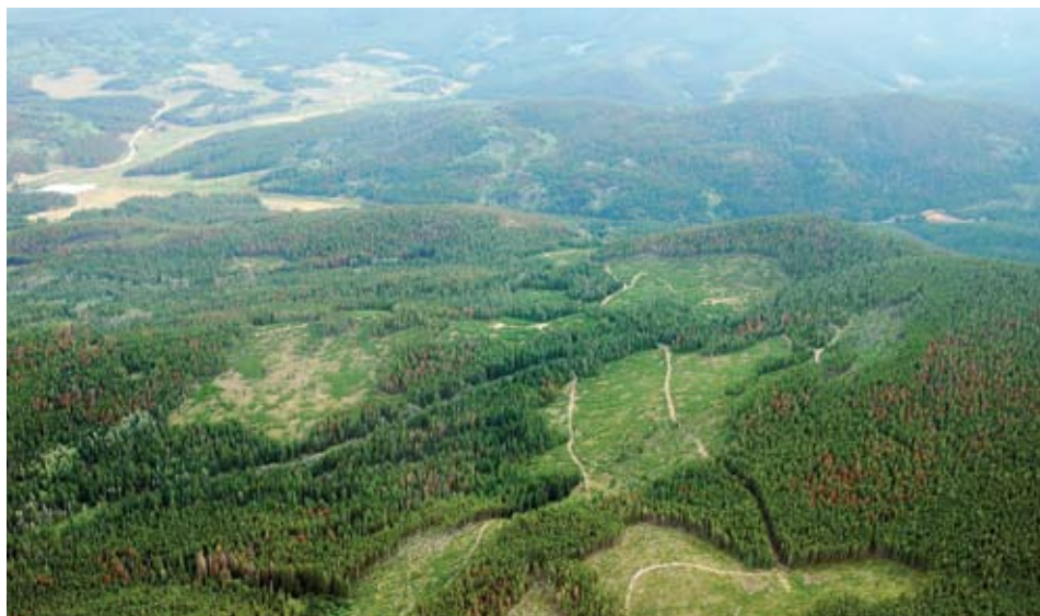
A rapidly building beetle population begins to overtake an area before all regeneration targets can be completed.

Considerable uncertainty exists about fire behavior following a mountain